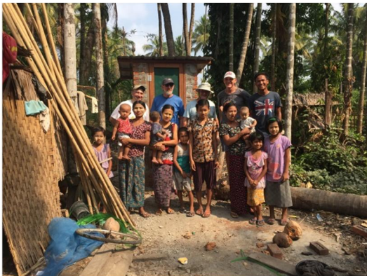
Proud and happy villagers with some of the Digging Deep team in front of their new toilet.