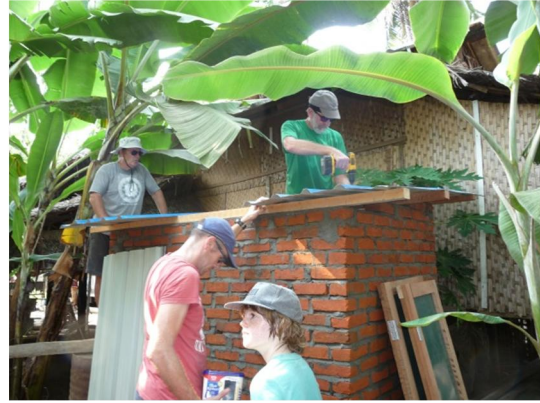
Installing the corrugated roof.