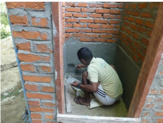
Rendering the inside of the toilet.