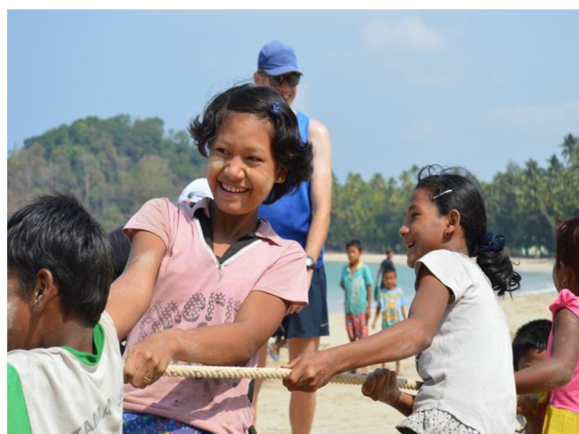
Playing 'Tug of War', a favourite game.