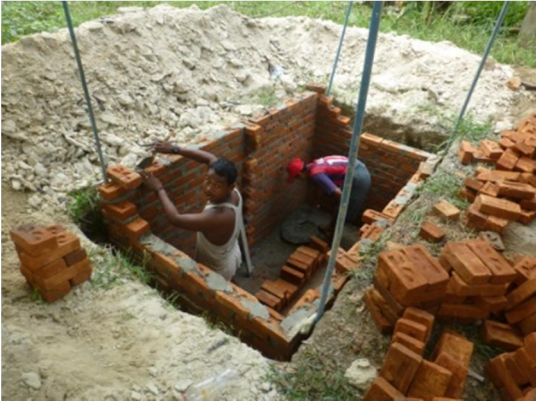
Local tradesmen building the septic tank.