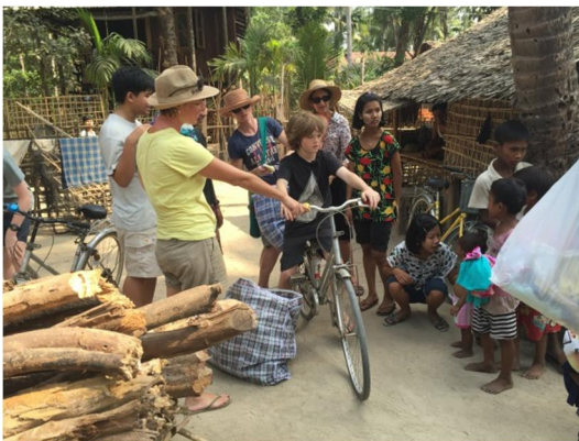
Large bags full of donated clothes moved from village to village on the back of bicycles.