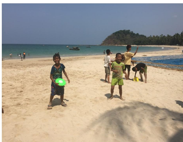
Practicing with their new toys.