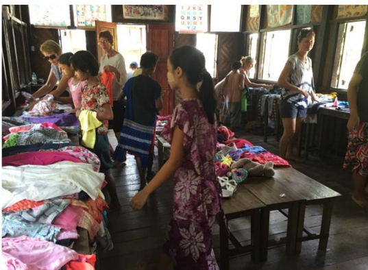
Pupils from the Andrew Clark Trust English School are helped to find clothes to fit them.