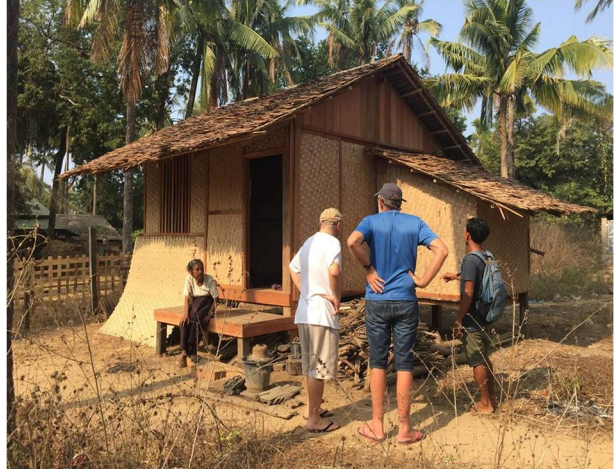
She proudly sits on the step of her new home.