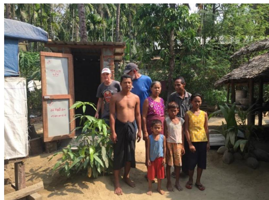
Written on the toilet door not graffiti, but instructions, 'Please use 20 cups of water to flush' and 'Please leave clean and tidy'.

We are also in the process of repairing and renovating five toilets for the local public school. These toilets had fallen into disrepair and without the availability of government funding to repair them, the school of over 600 children had been left with two functioning toilets, the ones we built last year. We supervised the reconstruction of the septic tanks and installed new absorption trenches while we were there. The renovation of the toilet building is proceeding under the supervision of Htein Lin, our site supervisor.