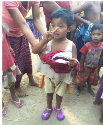
Showing off a new pair of shoes.