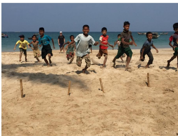
There were about 70-80 kids for the games this year, split into teams.