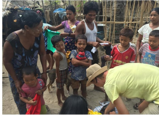
Hopeful villagers wait for clothes to fit their kids.