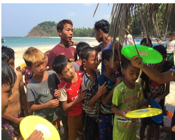
Gifts are given to every child at the end of the games.