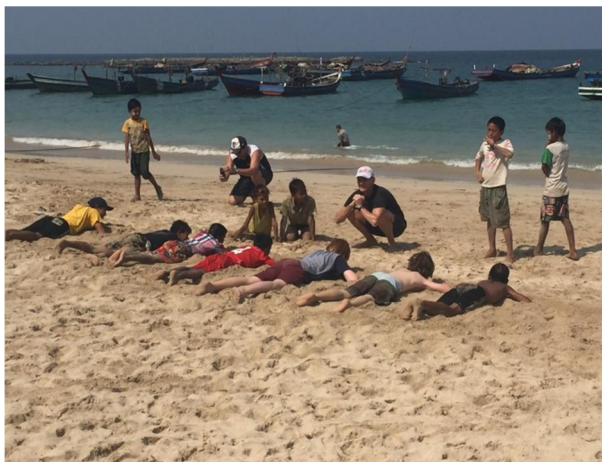
Sports Day for the village kids. This year they were taught how Aussie Nippers play Flags.

The Digging Deep team brought with them 25 soccer balls, 40 frisbees, 25 skipping ropes, 4 cricket sets, hand balls and beach balls. We held a sports day on the beach and all of the children were invited to join. There was a huge turn out and the sporting equipment was distributed amongst the children afterward.