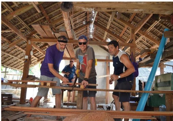
All hands on deck in the workshop making doors, cutting out the roofs for the toilets.

The team supervised and helped to construct of seven toilets at various locations in the village. These will provide for around 200 people and help to reduce the incidence of disease caused by current unhygienic practices. Local tradespeople were employed to do most of the work, thereby providing valuable income for the community.