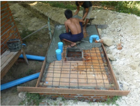
Pouring the septic tank lid.