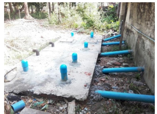
Repaired septic tanks and plumbing at the government school.

We are also in the process of repairing and renovating five toilets for the local public school. These toilets had fallen into disrepair and without the availability of government funding to repair them, the school of over 600 children had been left with two functioning toilets, the ones we built last year. We supervised the reconstruction of the septic tanks and installed new absorption trenches while we were there. The renovation of the toilet building is proceeding under the supervision of Htein Lin, our site supervisor.