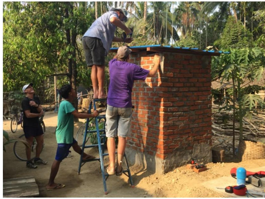
Installing the corrugated roof.